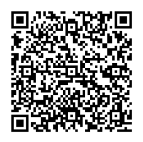
Thank You For Your Generosity